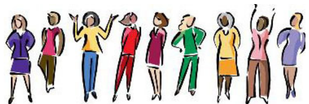
Ladies Tuesday Morning Bible Study Wants YOU!

LADIES BIBLE STUDY meets at 10 AM in the Church Office on the second and fourth Tuesday of each month. All women are welcome - we discuss the Bible or a book in terms of how our faith and beliefs affect our everyday lives. Women only!